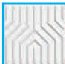
MANHATTAN EE396MHT-0061 600X600mm P53