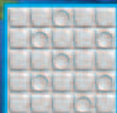
CHESS EE396CE5-0062 600X600mm