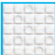
CHESS EE396CES-0062 600X600mm P51