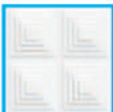
PYRAMID DD235ECO-J004 600X600mm P49