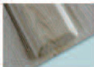
wood grain- nut-brown