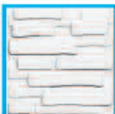
SLAB EE396SLB-0063 600X600mm P48